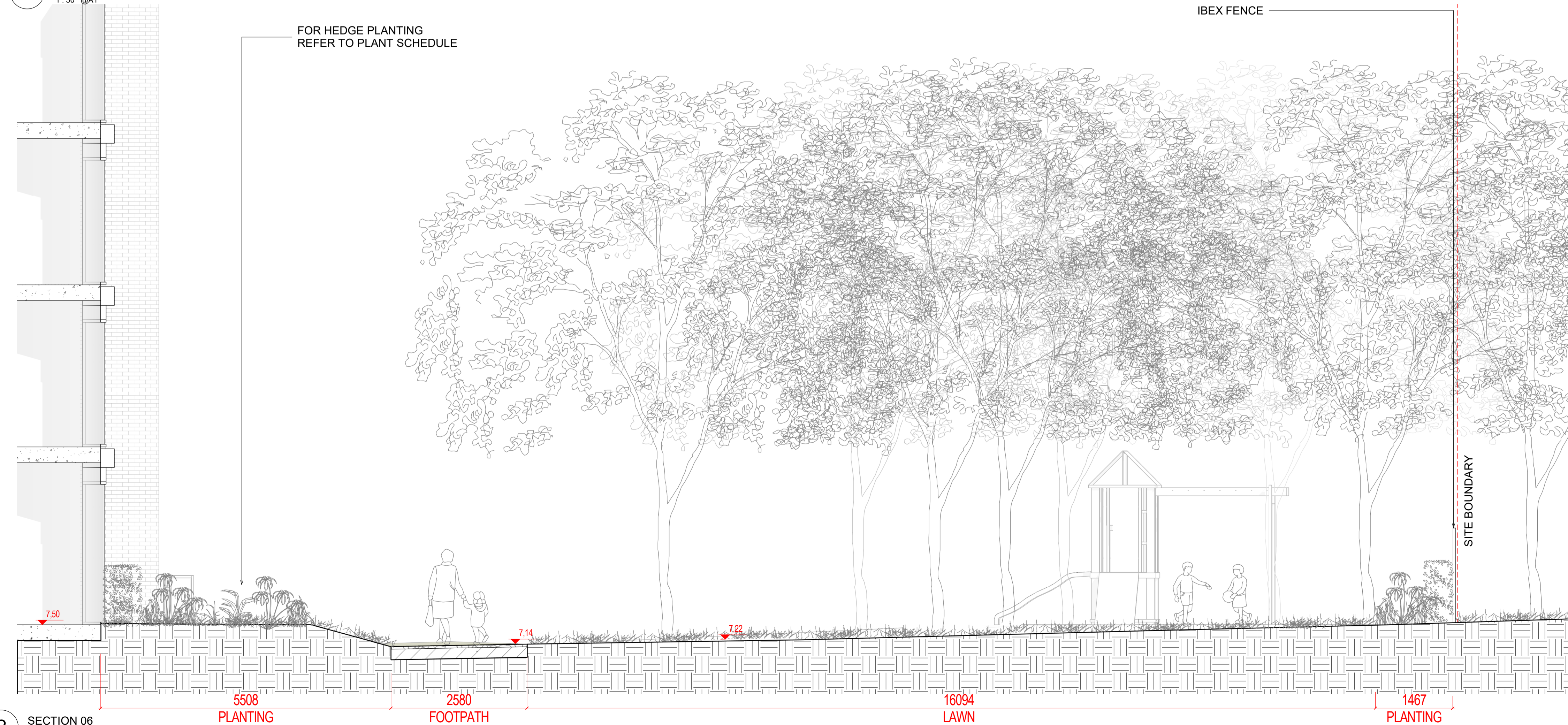
2 SECTION 06 1:50 @A1

BIM 360://Cioniffie/CLN-NMP-ZZ-M3-002.rvt